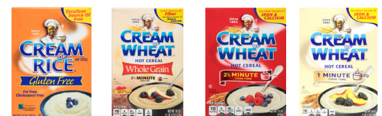
Cream of Rice (Crema de Arroz) Stove Top & Instant GF Cream of Wheat: Whole Grain★ Stove Top & Instant 2½ minute, 1 minute & Instant

Keep track of the cereal balance left on your WIC EBT card. Plan your cereal purchase so you are able to use all of the ounces (oz) for the month. If you buy 12, 18, 24, and 36 oz sizes of cereals, you will be more likely to use all of your cereal ounces.