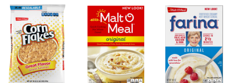
Corn Flakes Hot Wheat Original Farina Original