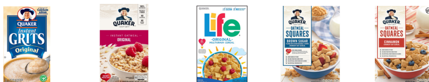
Instant Grits Original Instant Oatmeal Original★ Life Original★ Oatmeal Squares: Brown Sugar★ Cinnamon★