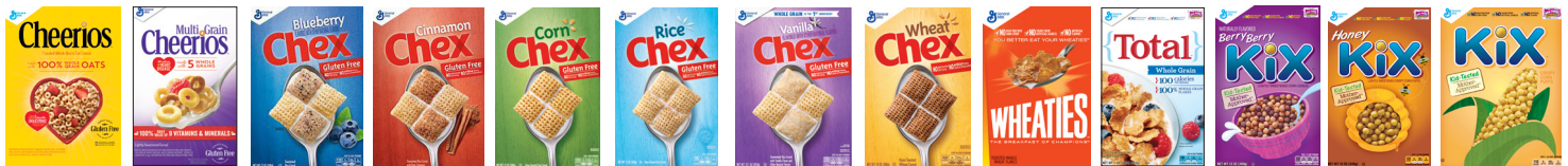
Cheerios ★GF MultiGrain Cheerios★GF Blueberry Chex GF Cinnamon Chex GF Corn Chex GF Rice Chex GF Vanilla Chex GF Wheat Chex★ Wheaties★ Total Whole Grain★ Berry Berry Kix★ Honey Kix★ Kix★