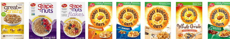
Great Grains Banana Nut Crunch★ Grape-Nuts★ Grape-Nuts Flakes★ Honey Bunches of Oats: Honey Roasted With Almonds Vanilla Bunches★ Whole Grain Honey Crunch★ Pecan & Maple Brown Sugar