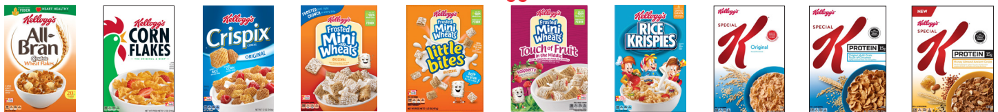
All Bran Complete Wheat Flakes★ Corn Flakes Crispix Frosted Mini-Wheats: Original★ Little Bites★ Touch of Fruit Raspberry★ Rice Krispies Special K Original Special K Protein: Original Multi-Grain★ Honey Almond Ancient Grains★